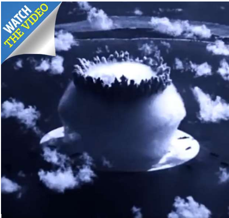
The plan aimed to wipe out the two countries' urban populations