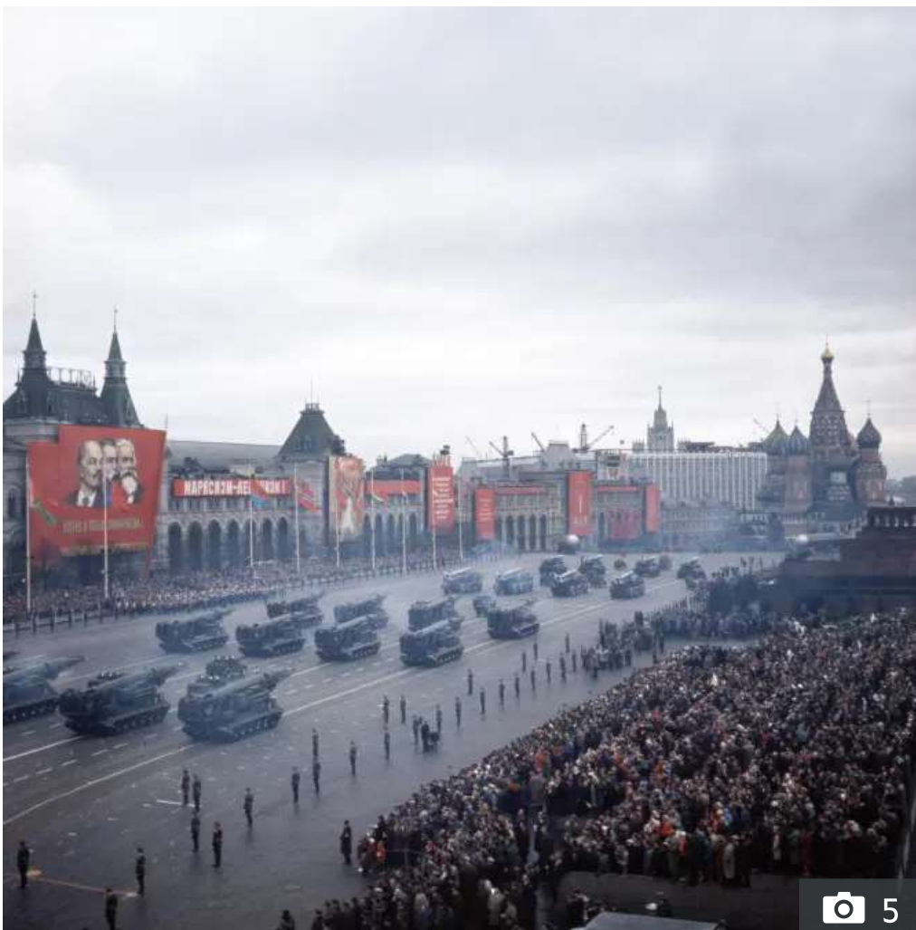
A 1961 estimate suggested that the US could kill 70 per cent of

In 1962, the Cuban Missile Crisis brought the world just seconds away from a nuclear midnight.